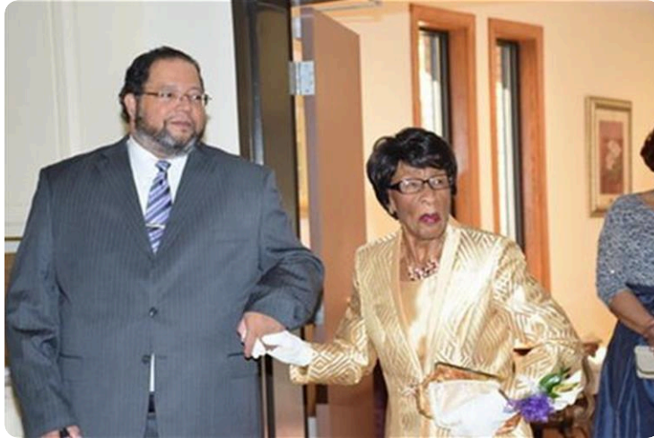
From a Happy 100th ...